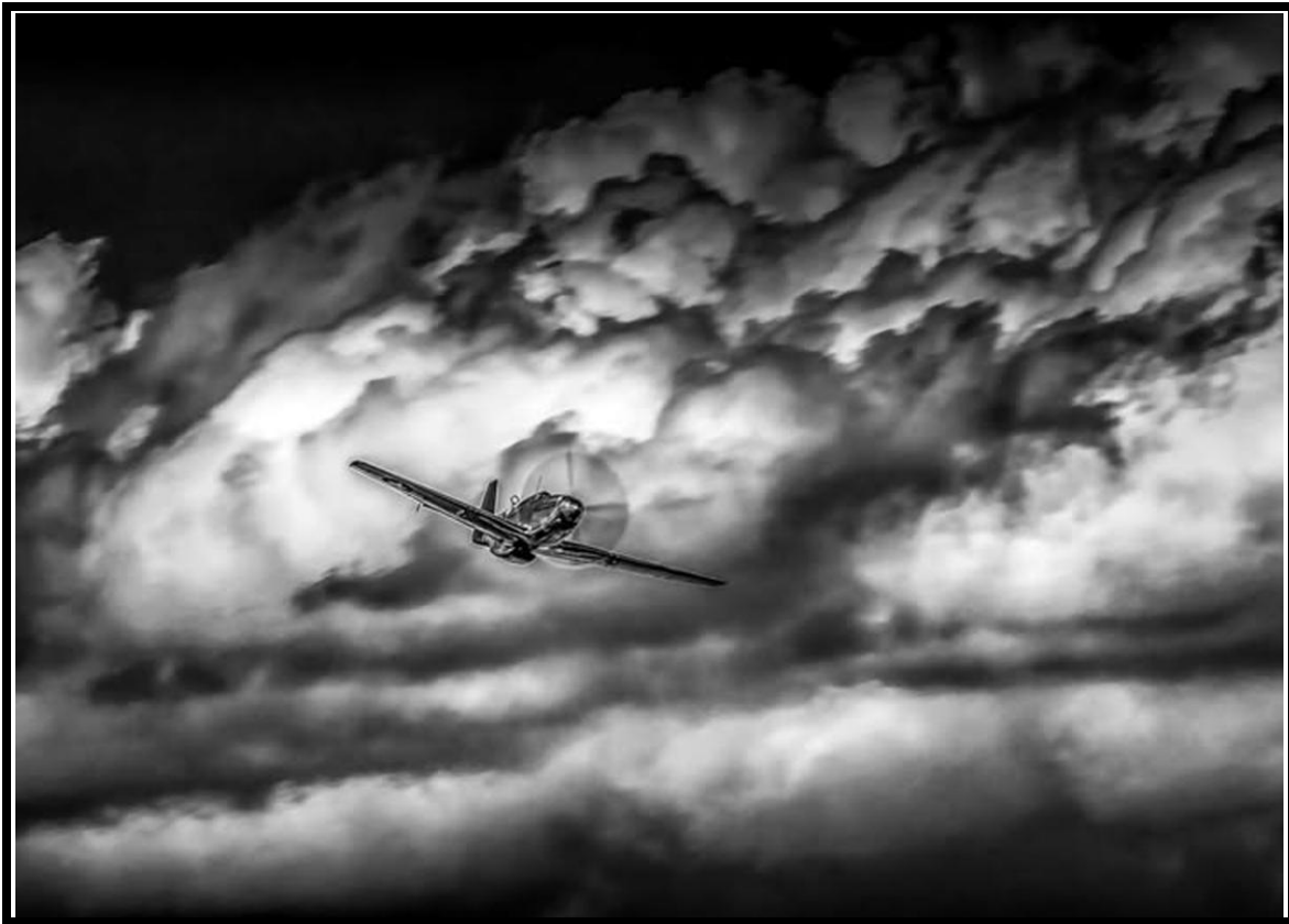
RIDING THE STORM BY WILL CAMPBELL