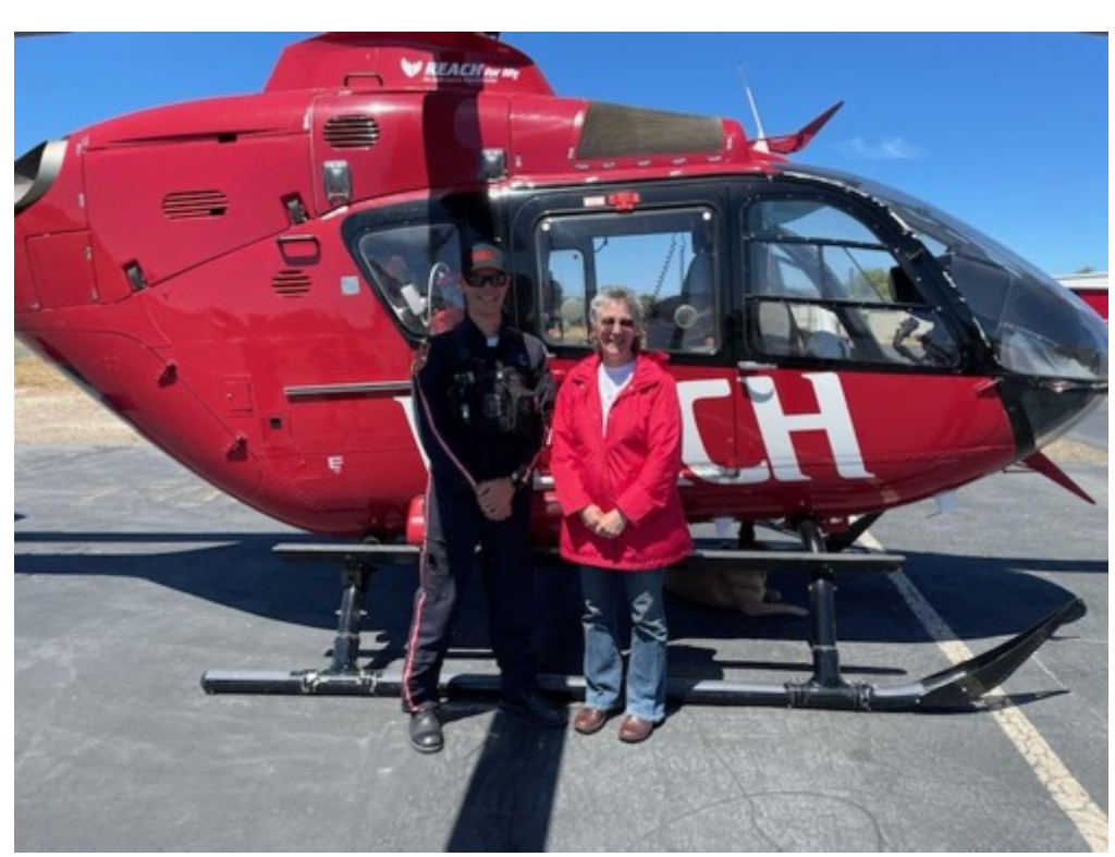
June 7, 2021 first REACH visit

Hosting the EMS teams will help ensure that.