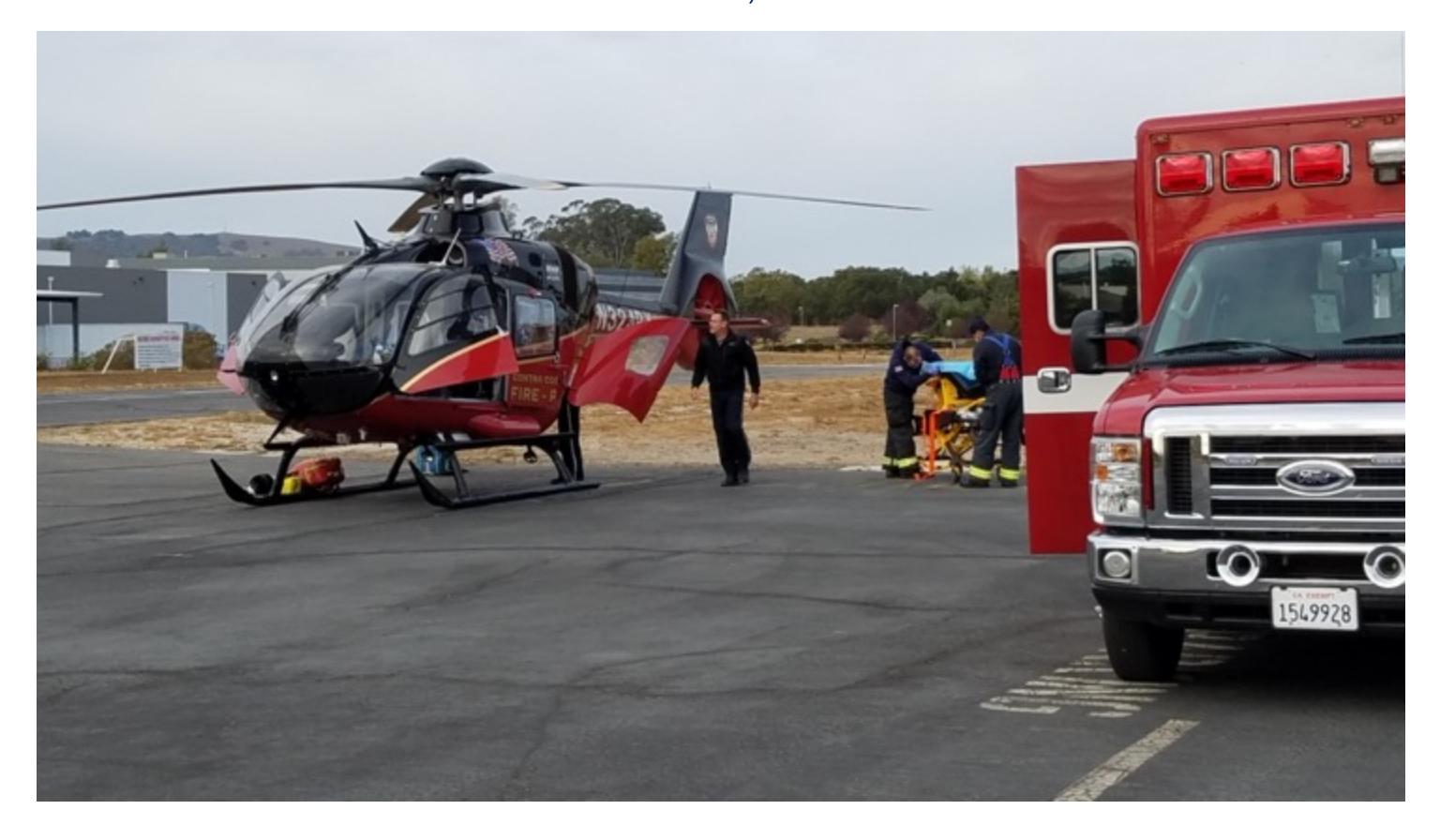
February 28, 2022