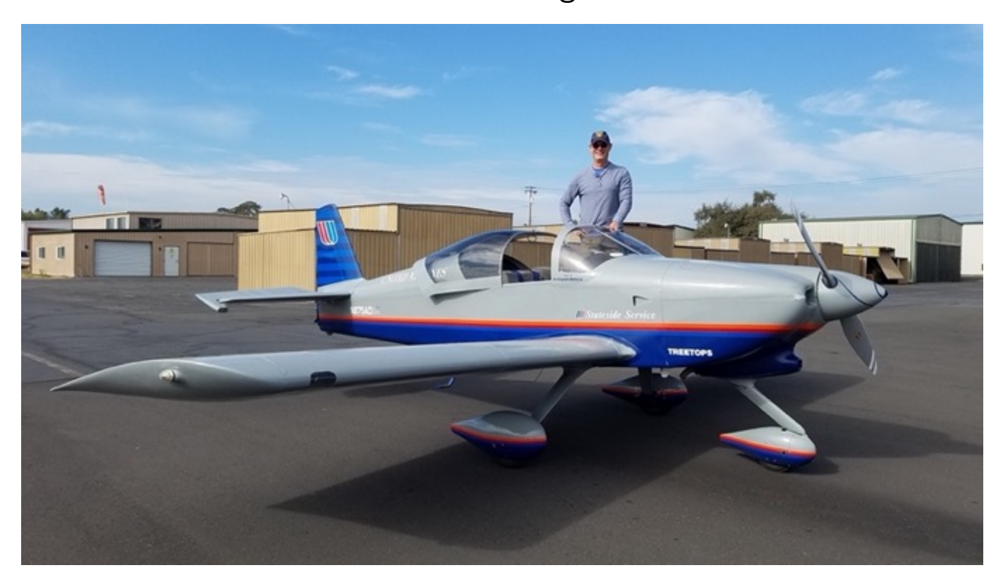
Our partners SVFD and REACH