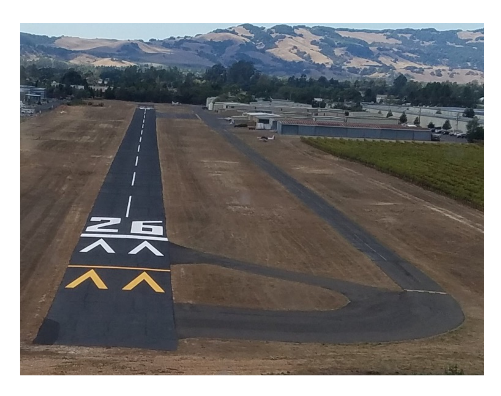
Enjoy October everyone! - tina

Here is a photo of our recently repaired and repainted runway. It was amazing to watch this project being completed. The feedback I am getting is pilots love it! Visit our Facebook page <a href="https://www.facebook.com/sonomaskypark/">https://www.facebook.com/sonomaskypark/</a> for the whole story.