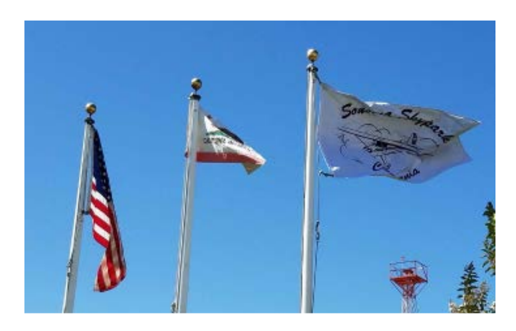
We have a new addition to our flag poles! It celebrates our lovely airport!

Sonoma Skypark Office will be closed Monday September 5, 2022 to observe this holiday.