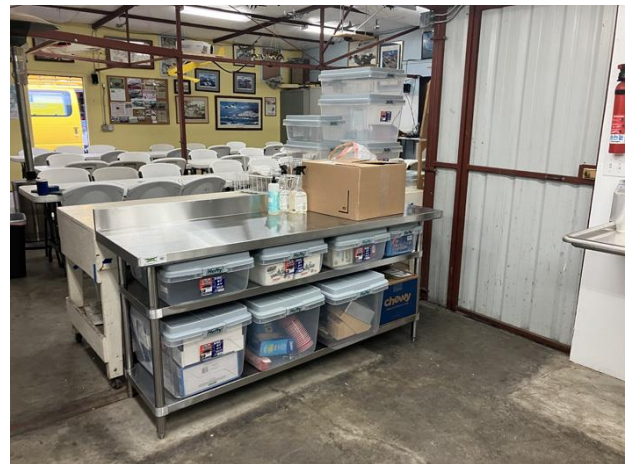
Makes you want to provide dinner? (hint, hint)