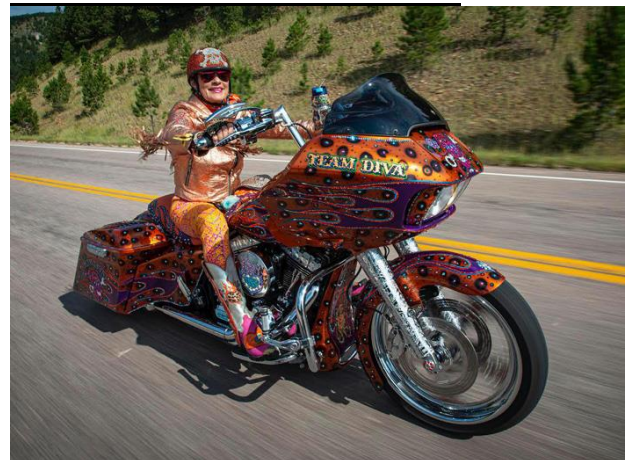
How about something more colorful.