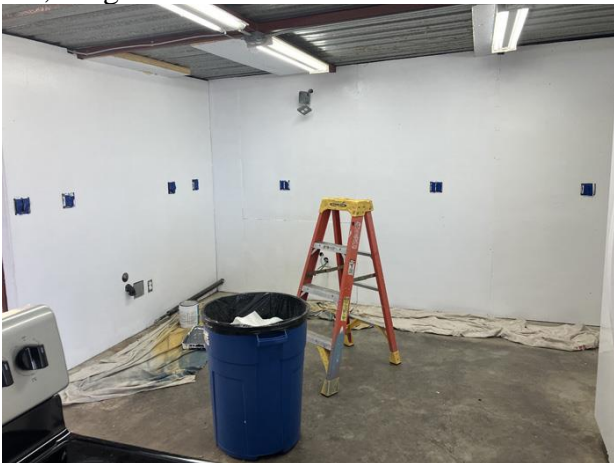
Glistening in the light with a new coat of paint.

After lunch, Ian spread out some drop clothes and gave the bare kitchen two coats of gloss white latex enamel to make it sparkle and shine.