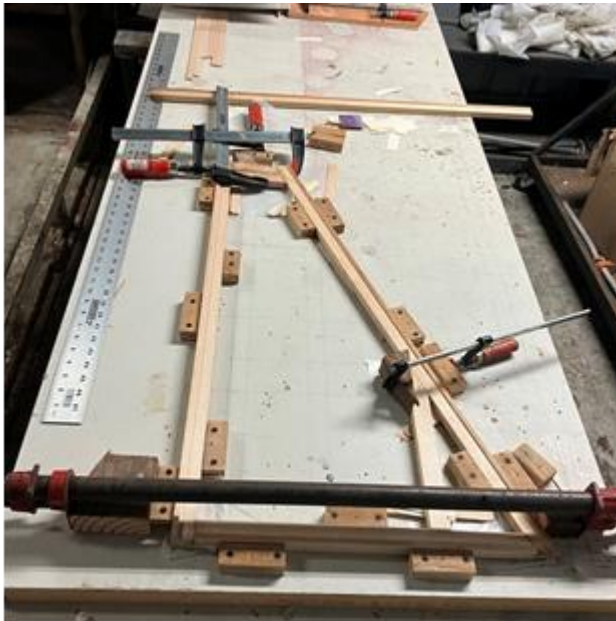
The vertical stabilizer going together in the Chapter workshop

The crew is starting with the vertical stabilizer to learn the construction skills and techniques necessary for building a wooden fuselage airplane.