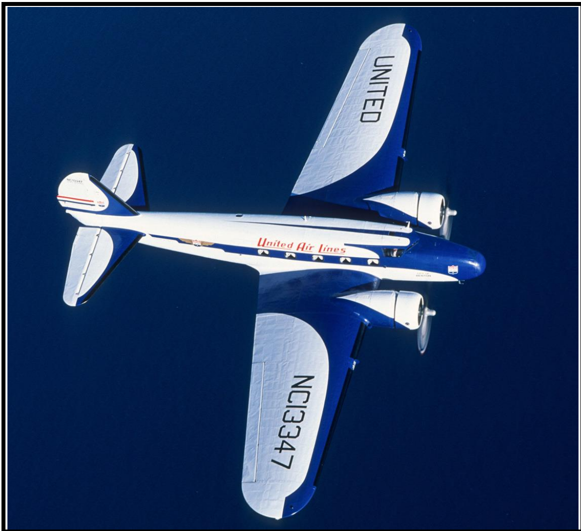
BOEING 247- THE FIRST MODERN AIRLINER